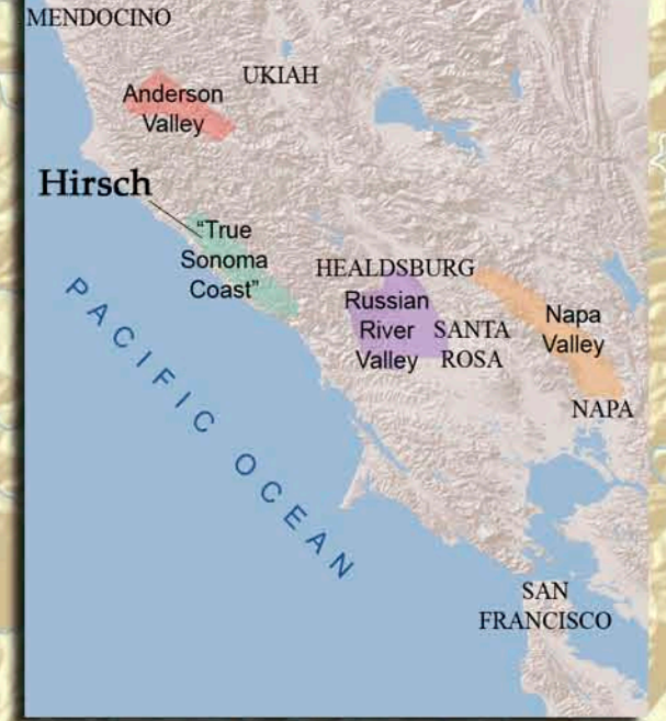
California's North Coast Wine Growing Areas